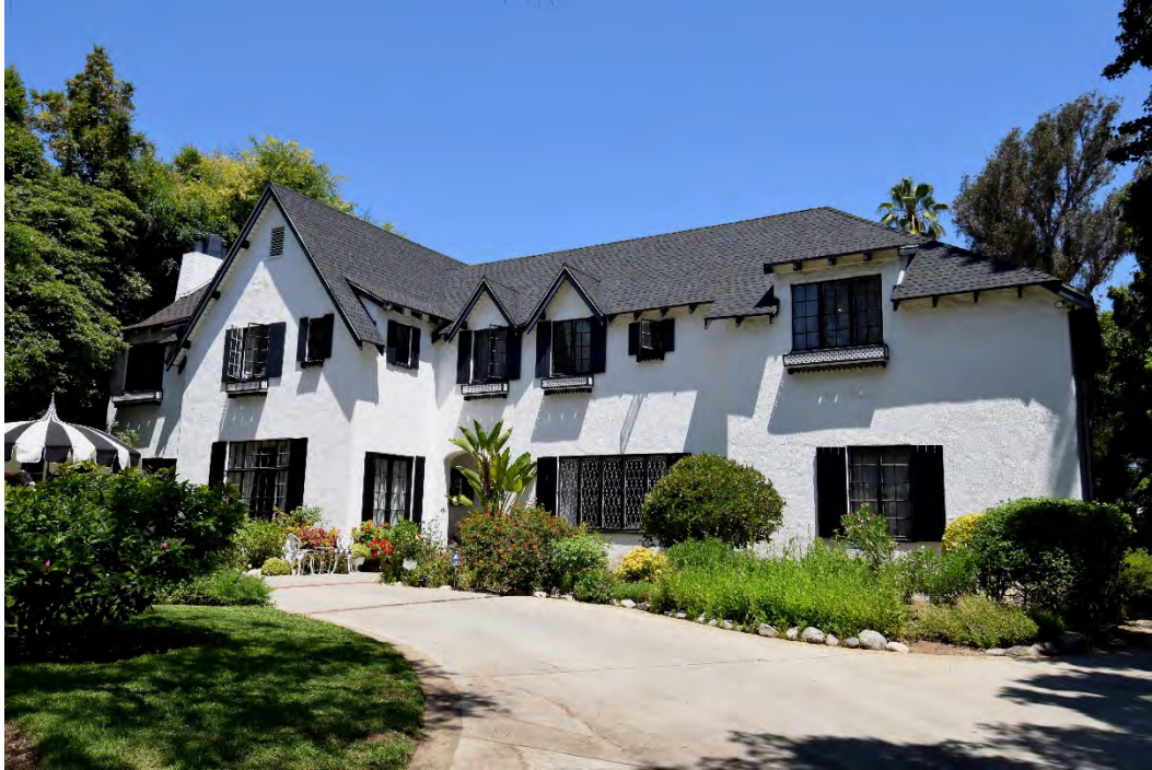
Photo 34 295 Wigmore Drive (#188-189), south façade, camera facing north (January 2020)