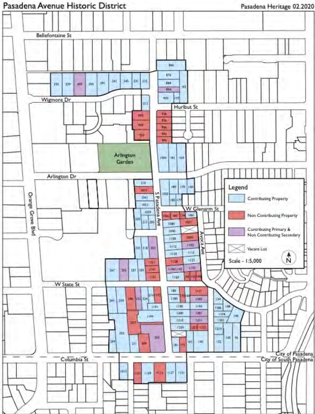
Figure 3. Sketch Map

Los Angeles, California County and State