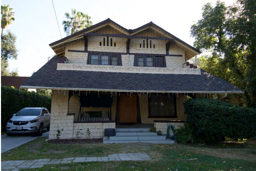
Photo 26 124 West State Street (#154-155), north(west) façade, camera facing southeast (January 2020)