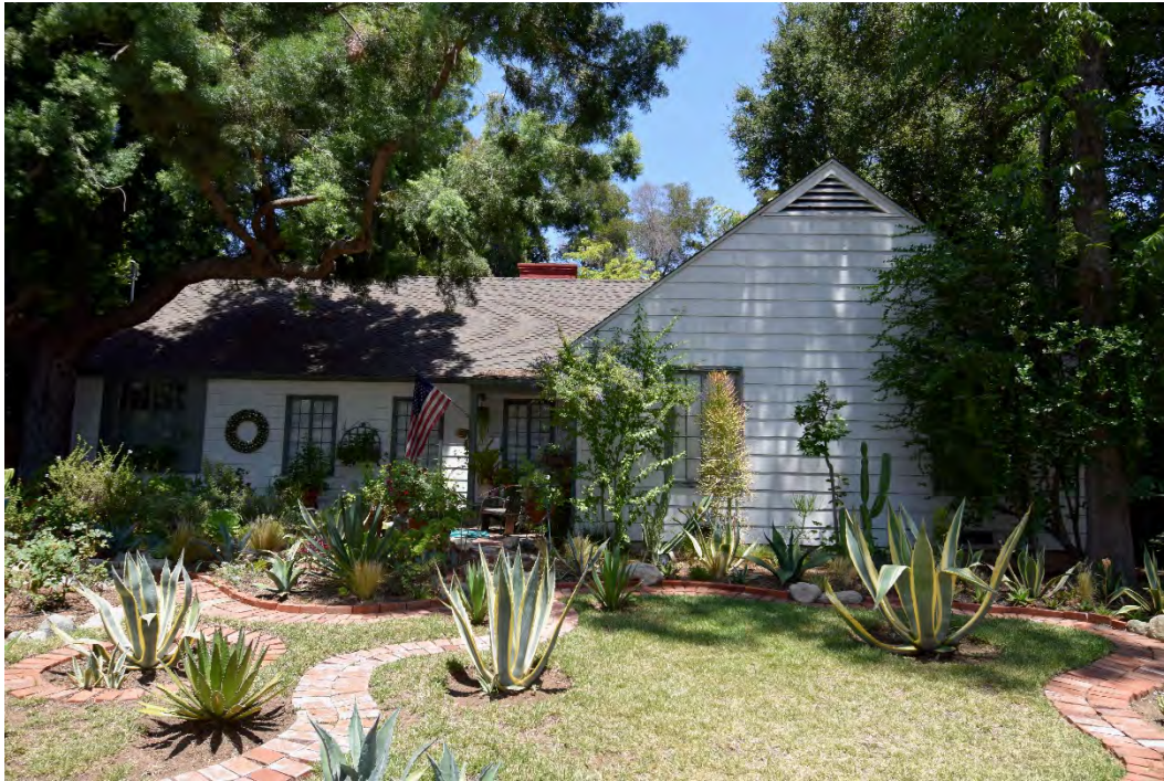
Photo 14 233 Columbia Street (#61-62), south façade, camera facing north