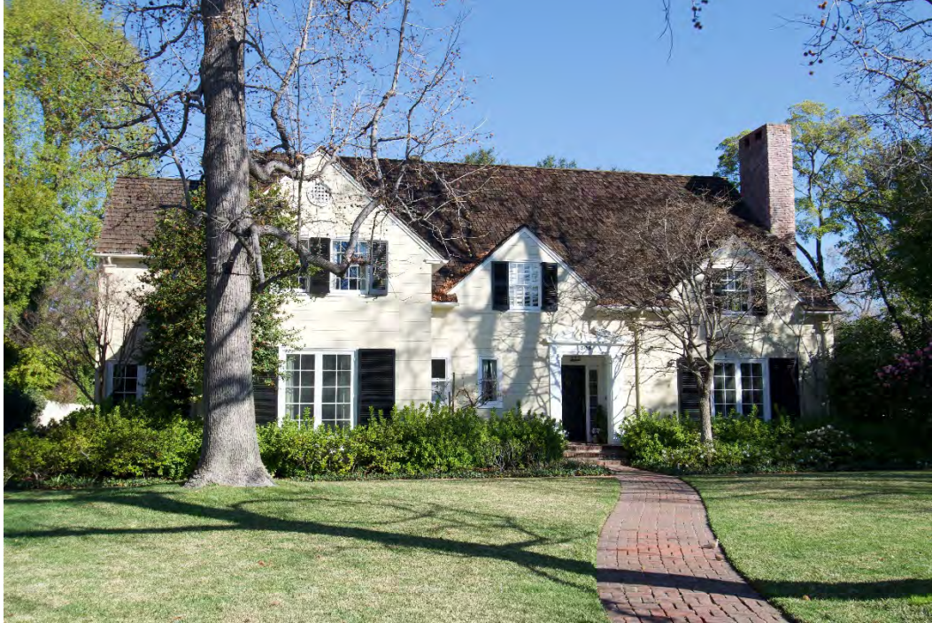
Photo 35 309 Wigmore Drive (#190-191), south façade, camera facing north (January 2020)

Los Angeles, California County and State