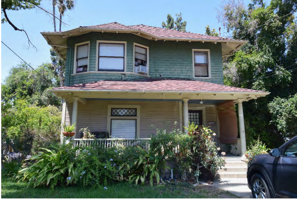
Photo 24 1112 South Pasadena Avenue (#126-127), west façade (left) and south elevation (right), camera facing northeast