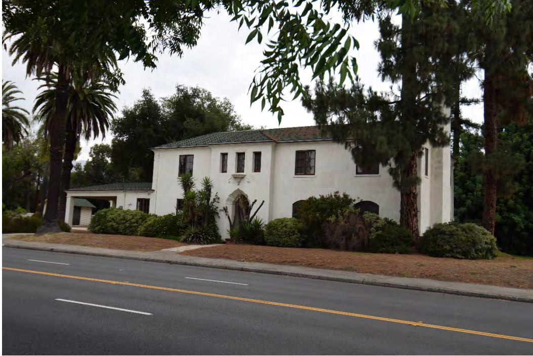
Photo 22 1030 South Pasadena Avenue (#115), west façade, camera facing east