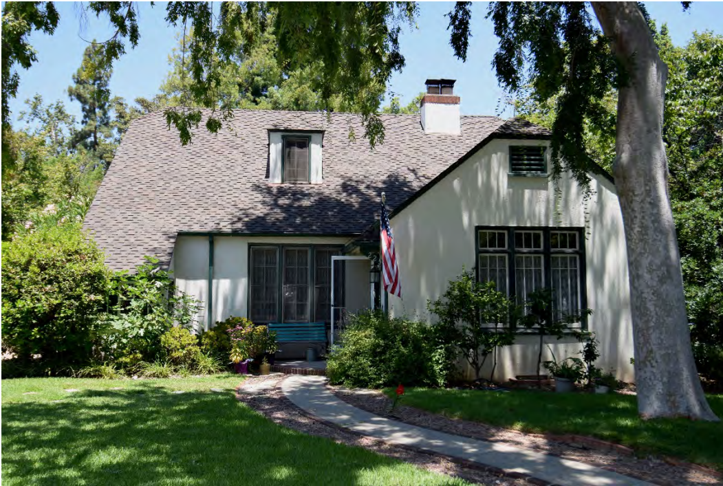
Photo 18 876 South Pasadena Avenue (#96-97), west façade (left and right) and south elevation (at center), camera facing east/northeast