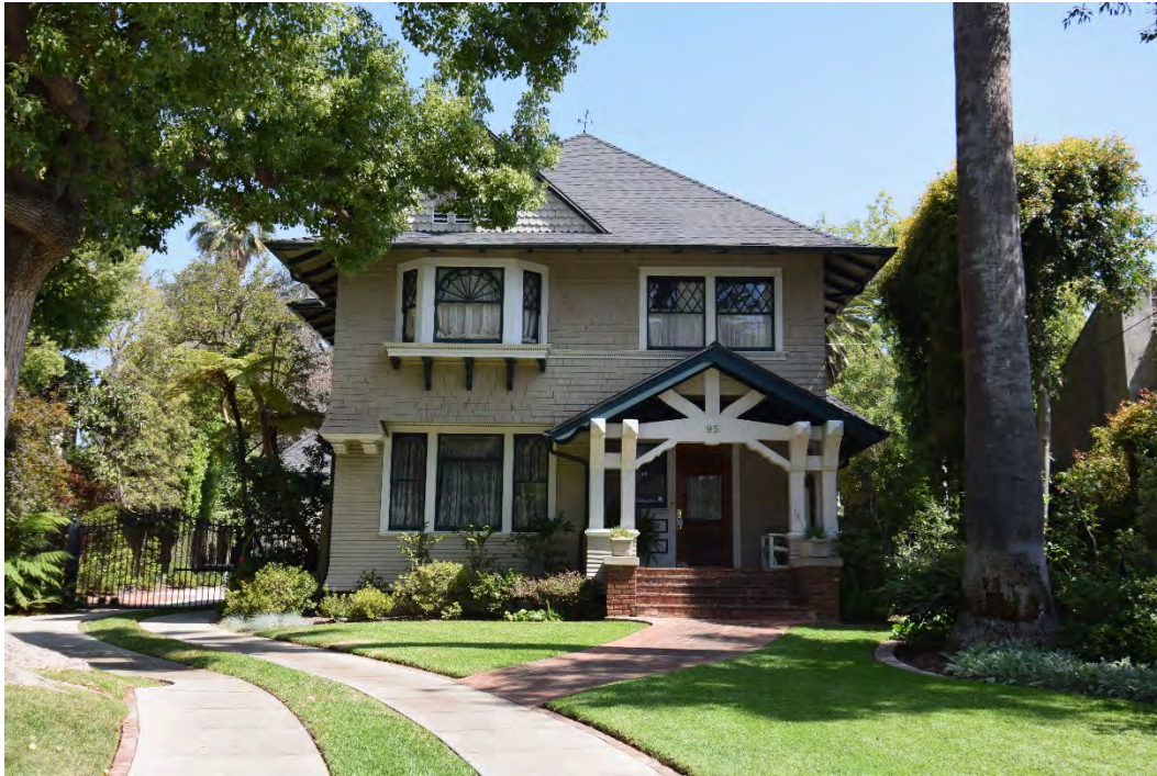
Photo 10 123 Columbia Street (#48), south façade, camera facing north