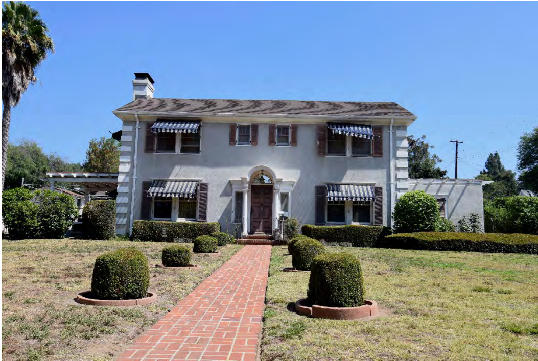
Photo 12 181 Columbia Street (#54-55), south façade, camera facing north