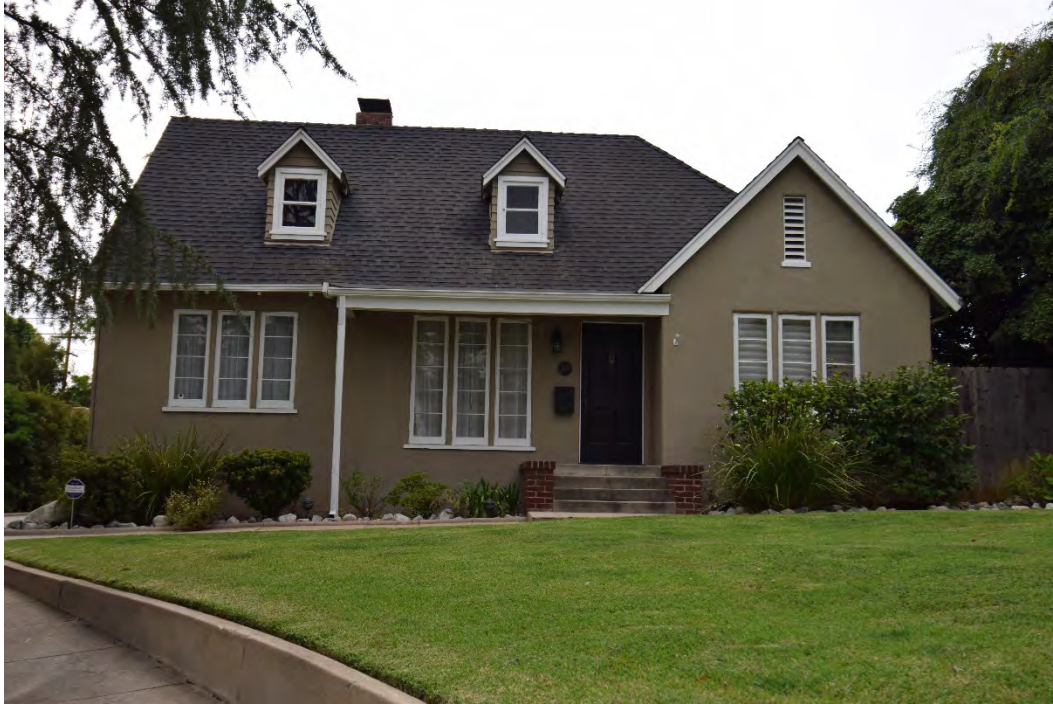
Photo 4 1061 Avoca Avenue (#11-12), east façade (left and north elevation (right)), camera facing southwest