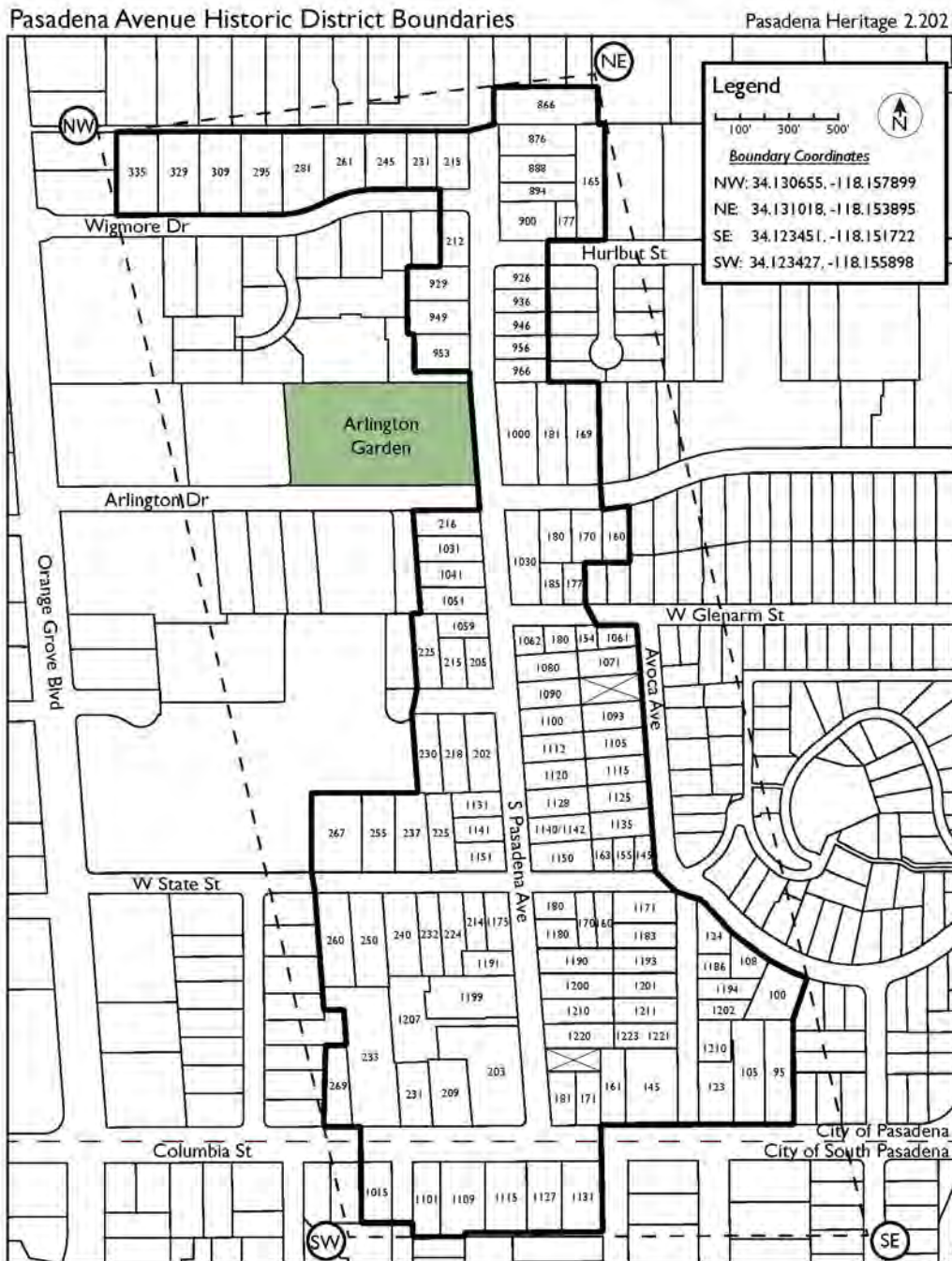
Figure 2. Site Map

Los Angeles, California County and State