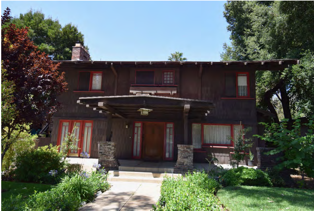
Photo 8 1210 Avoca Avenue (#38-39), west façade, camera facing east/southeast