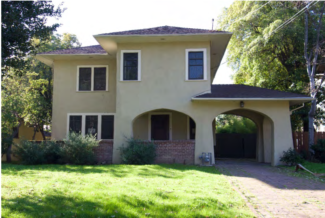
Photo 28 260 West State Street (#176-177), north façade, camera facing south