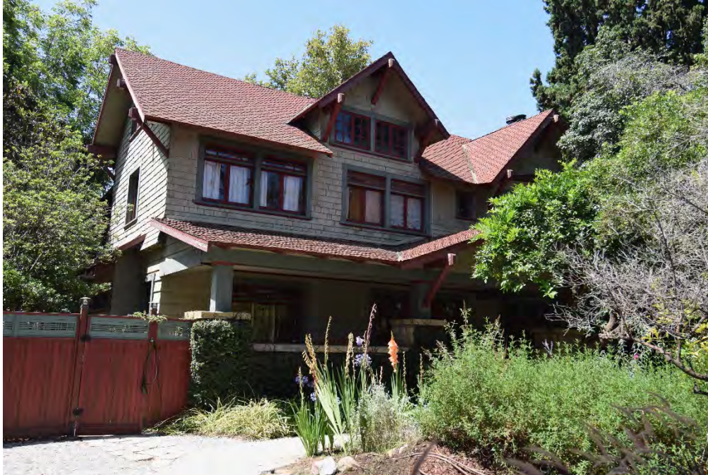
Photo 16 177 Hurlbut Street (#83), east elevation (left) and south façade (right), camera facing southeast