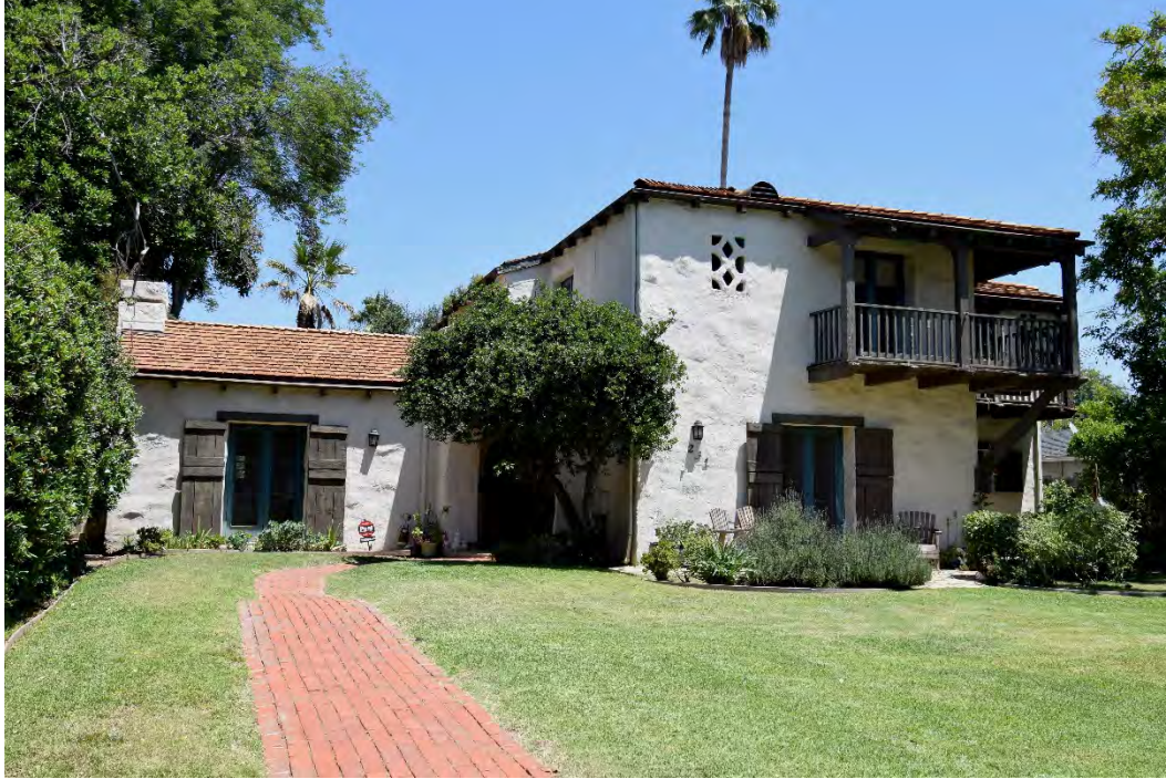
Photo 32 245 Wigmore Drive (#183-184), south façade, camera facing north (January 2020)