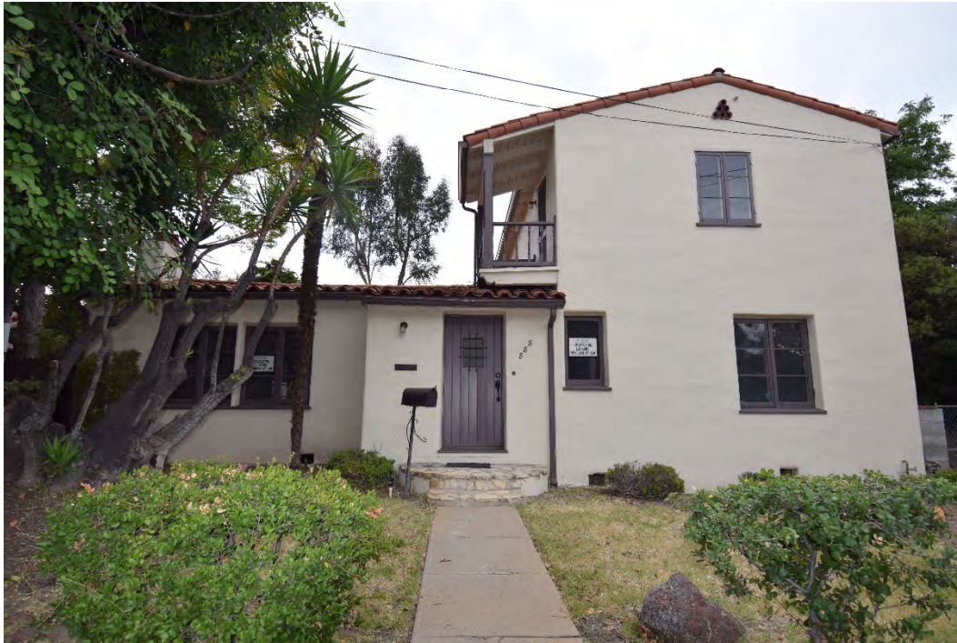
Photo 20 894 South Pasadena Avenue (#100-102), west façade (left) and south elevation (right), camera facing east/northeast