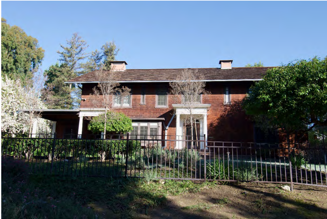
Photo 30 215 Wigmore Drive (#180-181), south façade, camera facing north