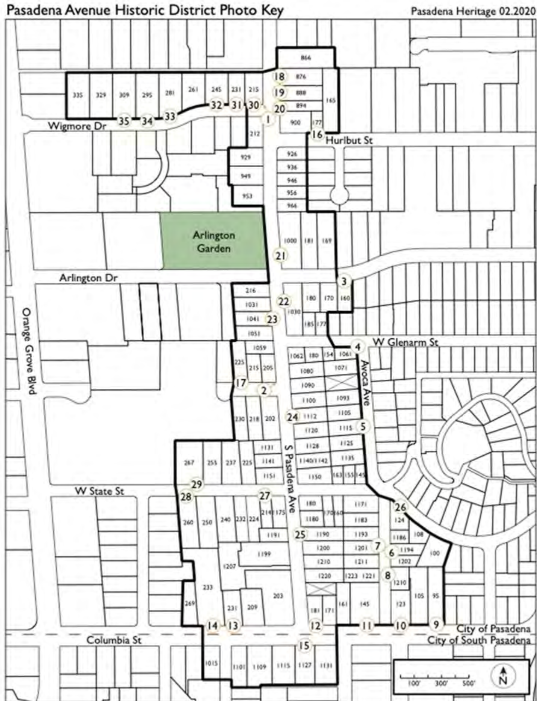
Figure 4. Photo Key

Los Angeles, California County and State